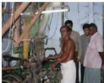
A power loom used in Ettayapuram

The first power loom was built by the Englishman Edmund Cartwright in 1785. Originally, powered looms were shuttle-operated but in the early part of the 20th century the faster and more efficient shuttleless loom came into use.