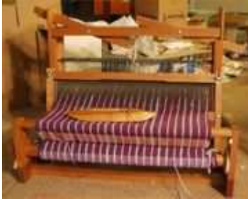
Four harness table loom.