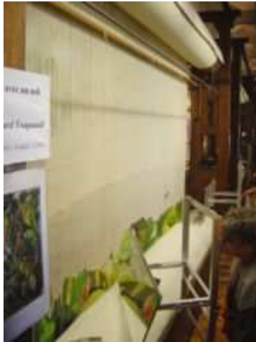
A haute lisse loom at the Gobelins manufactory in Paris, France

A harness is a complete set of loom parts; a lamm, a shaft and an upper harness of cords or jacks. A shaft is a frame which holds a set of heddles which guide some of the warp but not all on one shaft, there are always more than one shaft on a loom.