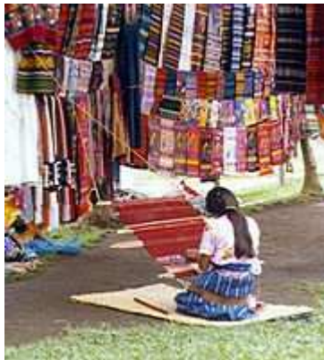
Guatemalan woman weaving on a backstrap loom, 1970s

Frame looms followed basically the same principles as ground looms. The loom was constructed out of sticks and boards attached at right angles (producing a box-like shape), which meant that it was portable and could even be held in the weaver's lap. Frame looms are still in use today, usually as a portable, less expensive, and compact alternative to a table or floor loom. Also known as a Small Loom.