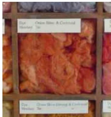
Wool dyed with cochineal

Traditionally cochineal was used for colouring fabrics. During the colonial period, with the introduction of sheep to Latin America, the use of cochineal increased, as it provided the most intense colour and it set more firmly on woolen garments than on clothes made of materials of pre-Hispanic origin such as cotton, agave fibers and yucca fibers. Once the European market had discovered the qualities of this product, their demand for it increased dramatically. Carmine became strong competition for other colourants such as madder root, kermes, Polish cochineal, brazilwood, and Tyrian purple, as they were used for dyeing the clothes of kings, nobles and the clergy. It was also used for painting, handicrafts and tapestries. [4] Cochineal-coloured wool and cotton are still important materials for Mexican folk art and crafts.