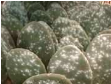
Cochineal-infested pads of the cactus Opuntia ficus-indica .

Dactylopius coccus is native to tropical and subtropical South America and Mexico, where their host cacti grow natively. They have been introduced to Spain, the Canary Islands, Algiers and Australia along with their host cacti. There are 150 species of Opuntia cacti, and while it is possible to cultivate cochineal on almost all of them, the best to use is Opuntia ficus-indica . All of the host plants of cochineal colonies were identified as species of Opuntia including Opuntia amyclaea , O. atropes , O. cantabrigiensis , O. brasiliensis , O. ficus-indica , O. fuliginosa , O. jaliscana , O. leucotricha , O. lindheimeri , O. microdasys , O. megacantha , O. pilifera , O. robusta , O. sarca , O. schikendantzii , O. stricta , O. streptacantha , and O. tomentosa . 1 Feeding cochineals can damage the cacti, sometimes killing their host. Cochineals other than D. coccus will feed on many of the same Opuntia species, and it is likely that the wide range of hosts reported for the former species is because of the difficulty in distinguishing it from these other, less common species.