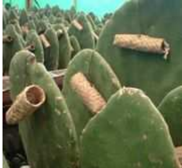
Zapotec nests on Opuntia ficus-indica host cacti

clean, fertile females which leave the nests and settle on the cactus to await insemination by the males. In both cases the cochineals have to be protected from predators, cold and rain. The complete cycle lasts 3 months during which the cacti are kept at a constant temperature of 27 °C. Once the cochineals have finished the cycle, the new cochineals are ready to begin the cycle again or to be dried for dye production.